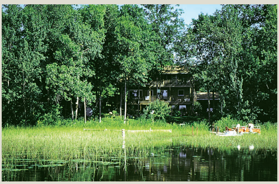
Good fishing doesn't just happen. It's the result of clean water and abundant spawning habitat found in lakes and rivers that still have plenty of natural shoreline.

A healthy lake or river does not just happen. Shoreline property owners and others living in the watershed must take steps to ensure the ecological health of lakes and rivers. Only if more waterfront owners manage their shoreline in a natural condition can fish and wildlife populations on Wisconsin lakes and rivers stay healthy and abundant.