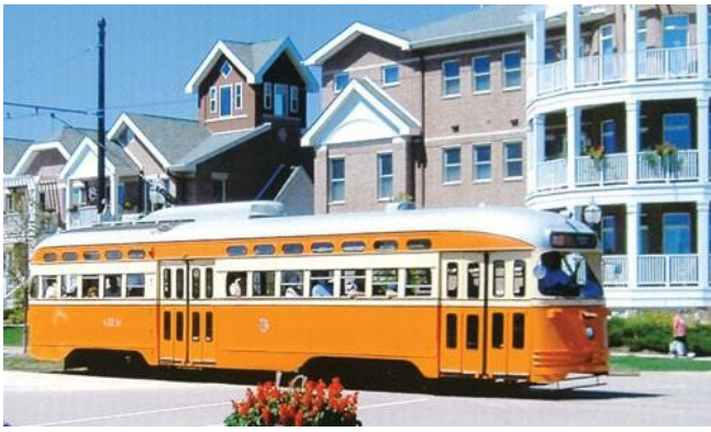
A streetcar passes in front of multi-family housing in Kenosha, Wisconsin.

efficient home construction techniques and fuel-efficient automobile technology. Its findings suggest that the most significant gains in household energy efficiency can be achieved when all of these efforts are combined.