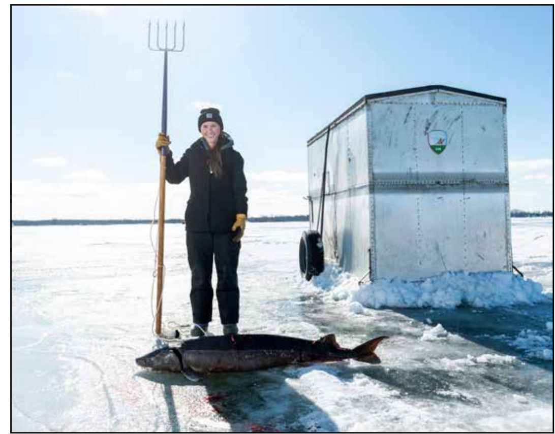
This young woman used determination, persistence, and a little luck to spear this sturgeon on the Lake Winnebago system