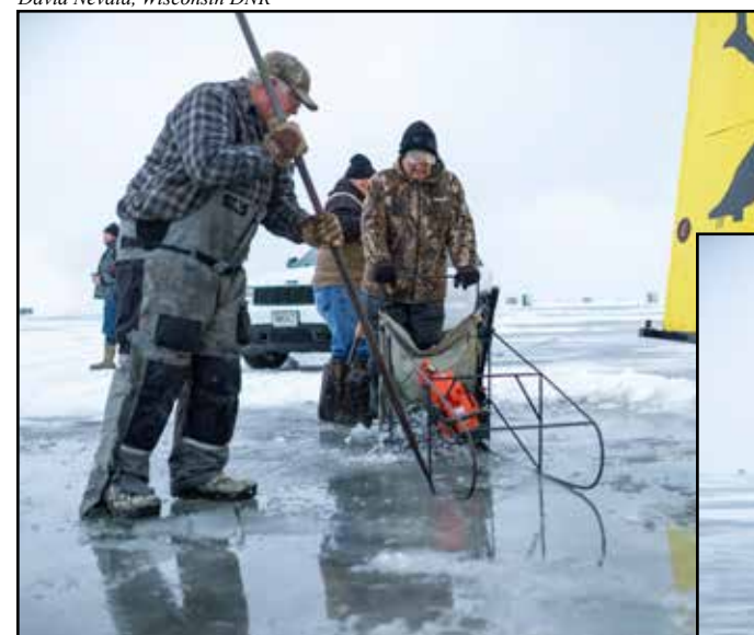
From chainsaws, to circular saws, to this home-made contraption, finding the perfect spot and cutting your sturgeon spearing hole is part of the experience. This crew works together to flip the rectangular piece of ice and then push it under the ice and away from the hole.