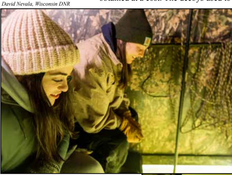
Patience and stillness are paramount when sturgeon spearing. Don't fall asleep, though - that cold water is not the wake-up call you want on a February in Wisconsin!

and harvest a lake sturgeon are quite varied and often hand-crafted heirlooms passed down through generations; these can be anything from a white coffee cup to an elaboratelycarved and painted wooden and copper lure. Instead of a hook and line, these sturgeon hunters use a heavy, barbed spear. You may have seen some of these decoys and spears at the 2019 "Ancient Survivors" exhibit in Fond du Lac at the Thelma Sadoff Center for the Arts in collaboration with the Wisconsin Water Library. If you didn't, you can view many photos from the exhibit online at <u>http://bit.</u> <u>ly/2HUCemQ</u>.