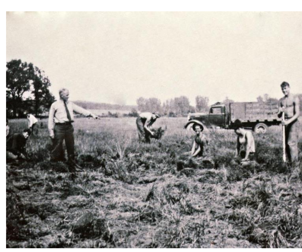
There is more to supervision than pointing and wearing a tie!