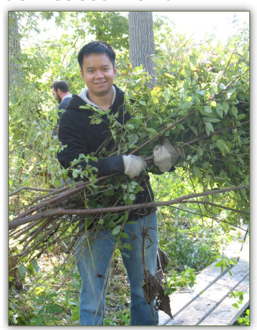
A volunteer restoration team leader - getting the job done!