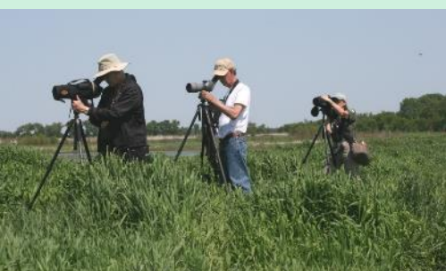
Rock River Coalition