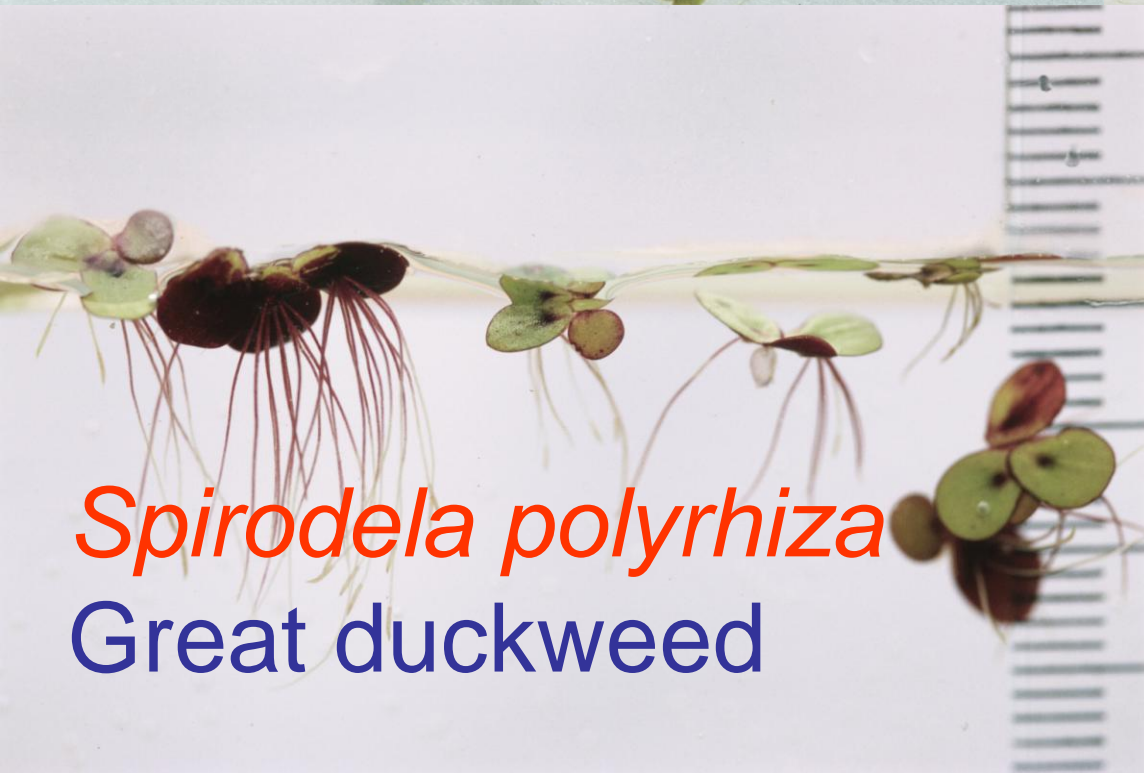
Spirodela polyrhiza Great duckweed