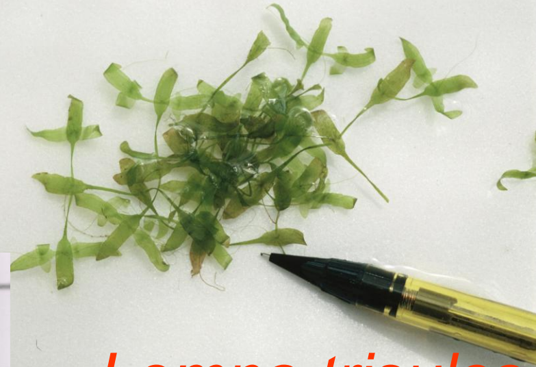
Lemna trisulca Forked duckweed