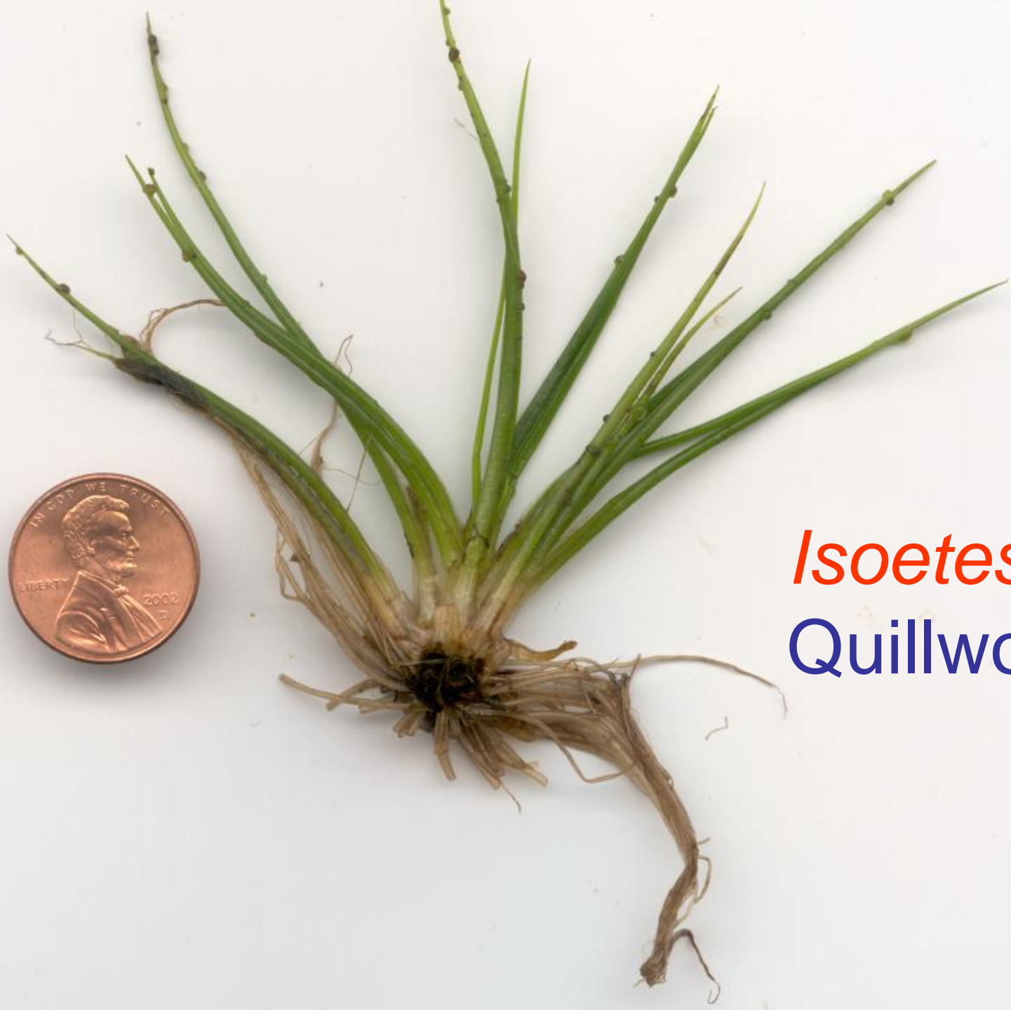
Isoetes sp. Quillwort