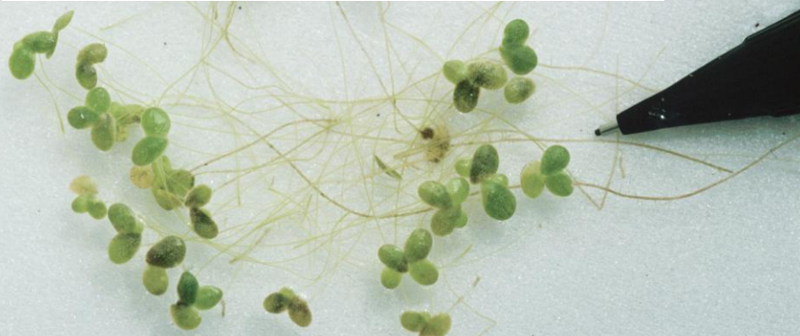
Lemna minor Small duckweed