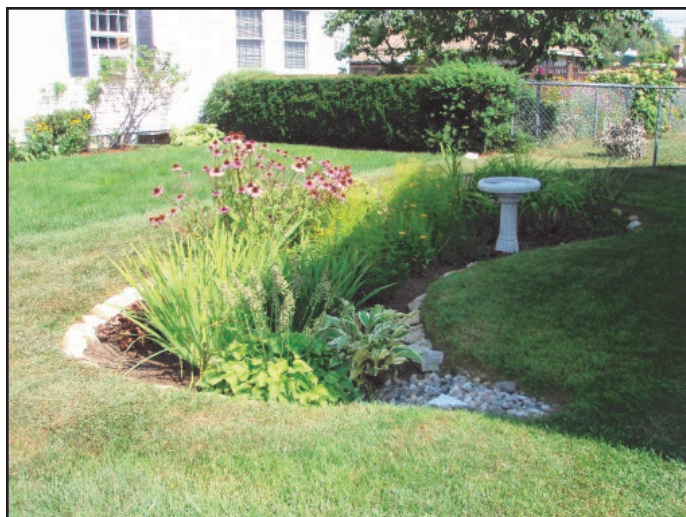
A small rain garden with native plants captures and filters runoff from rain events.

Rain gardens can be placed in sunny or shady regions of your lawn, but plants should be chosen accordingly, with the lowest point planted with wet tolerant species, the sides closest to the center planted with moist tolerant species, and the edges of the rain garden should be planted with moist to dry or dry tolerant plants. It is also important to check the permeability of your soil. Sandy soils only need compost added, but clay soils should be replaced with a mix (50– 65% sand, 15-30% topsoil, 2 -30% compost). After construction of the garden is complete, the entire area should be covered with a thick layer of mulch, preferably Erosion Control Mix .