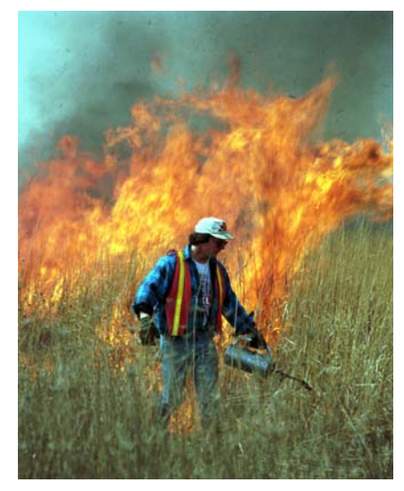
Large-scale natural landscaping may occasionally require a controlled burn for proper maintenance of the habitat.

School districts and park districts are increasingly incorporating natural landscaping into their properties. In addition to aesthetic and maintenance benefits, establishing prairies and wetlands provides a unique educational vehicle to convey ecological and natural history concepts. Maintenance of natural landscapes also provides a hands-on opportunity for students and volunteers to interact with natural processes.