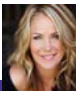
Andrea Anders Television and film: Better off Ted, Joey, Modern Family