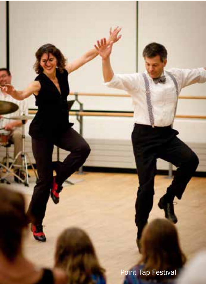
Point Tap Festival