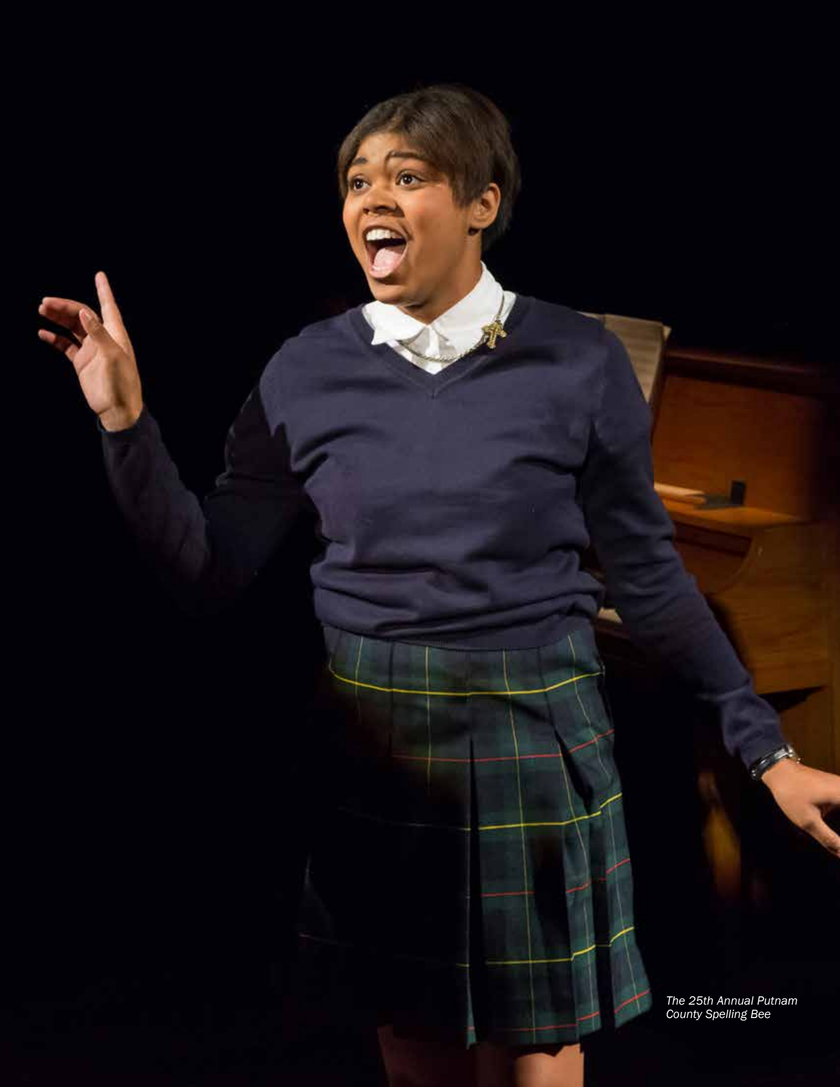
The 25th Annual Putnam County Spelling Bee