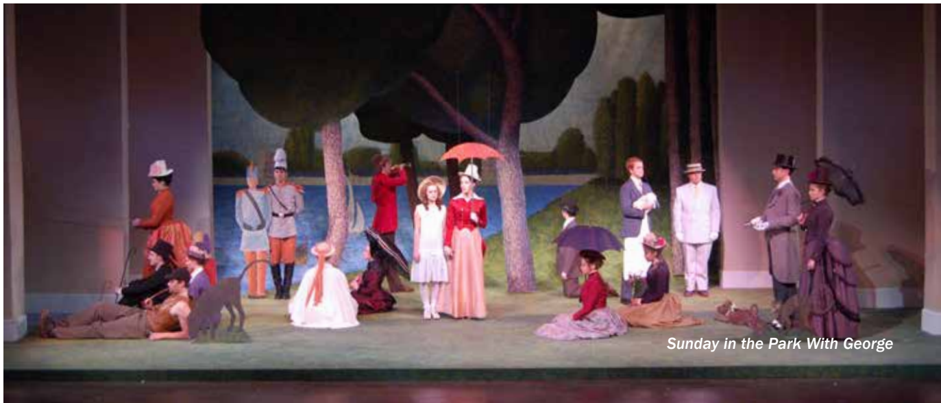
Sunday in the Park With George

UW-Stevens Point offers you an invigorating program that emphasizes discipline, commitment and a professional work ethic. Graduates of this program have gone on to work on Broadway, Off-Broadway, with national tours, and in regional theatres across the country, as well as in film and television.