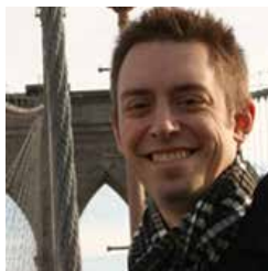
Gregory Kaye scenic design