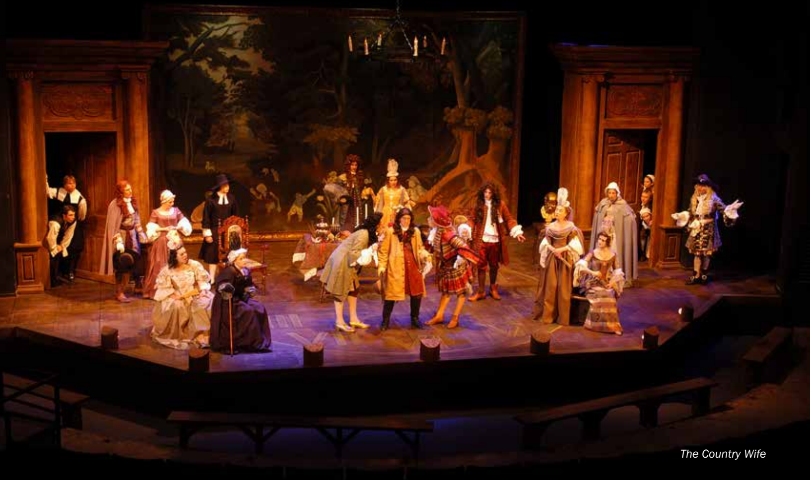
The Country Wife

The Department's active production schedule will provide Design and Technology majors hands-on experience in creating realized work for theatre and dance shows. You will be immersed in production processes during which the skills you learn in class will allow you to build your portfolio and resume.