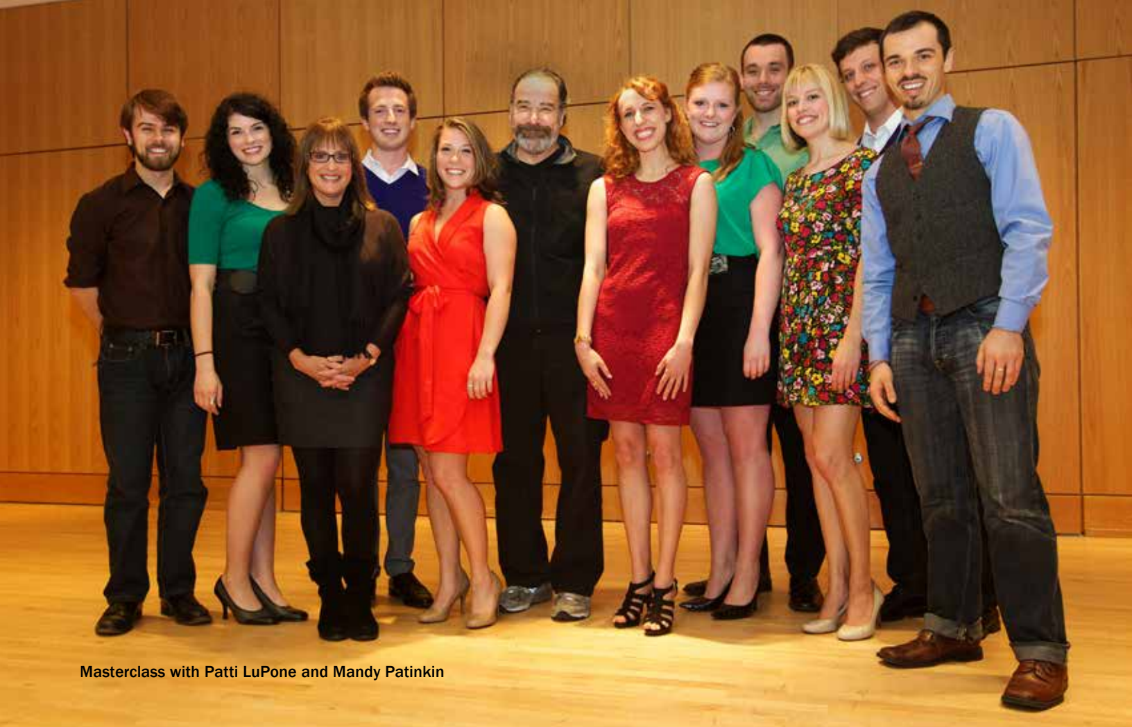
Masterclass with Patti LuPone and Mandy Patinkin