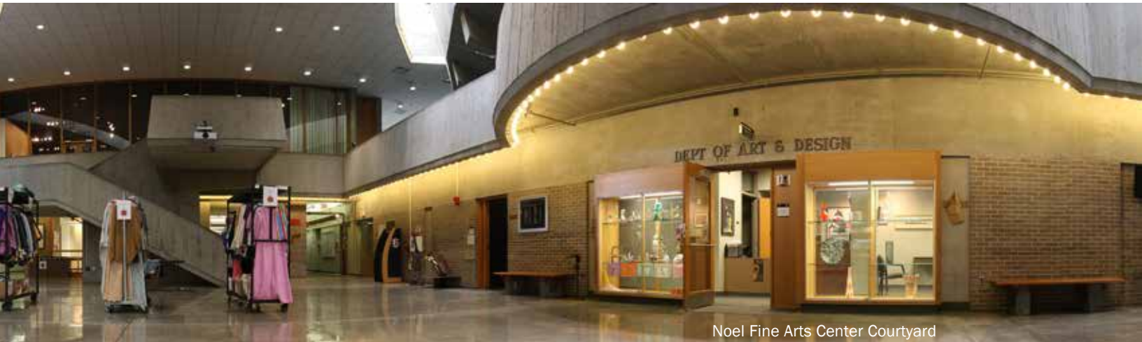
Noel Fine Arts Center Courtyard