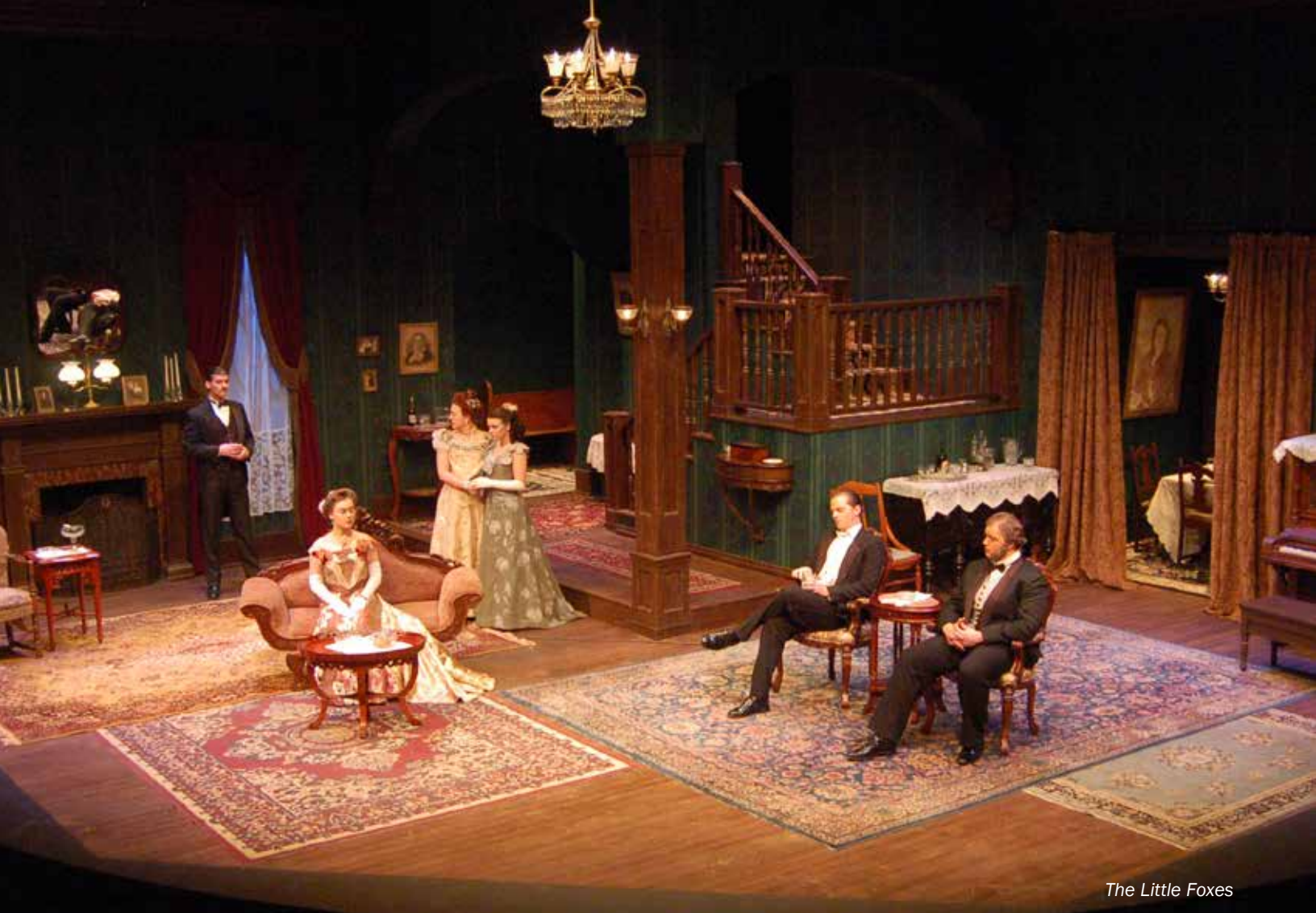
The Little Foxes