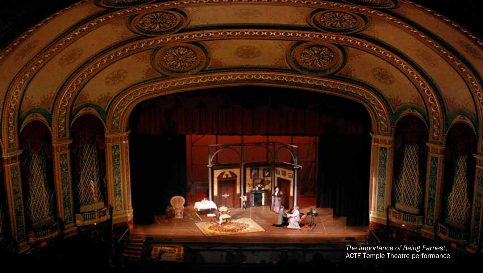
The Importance of Being Earnest, ACTF Temple Theatre performance