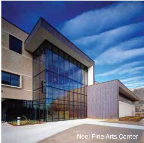
Noel Fine Arts Center