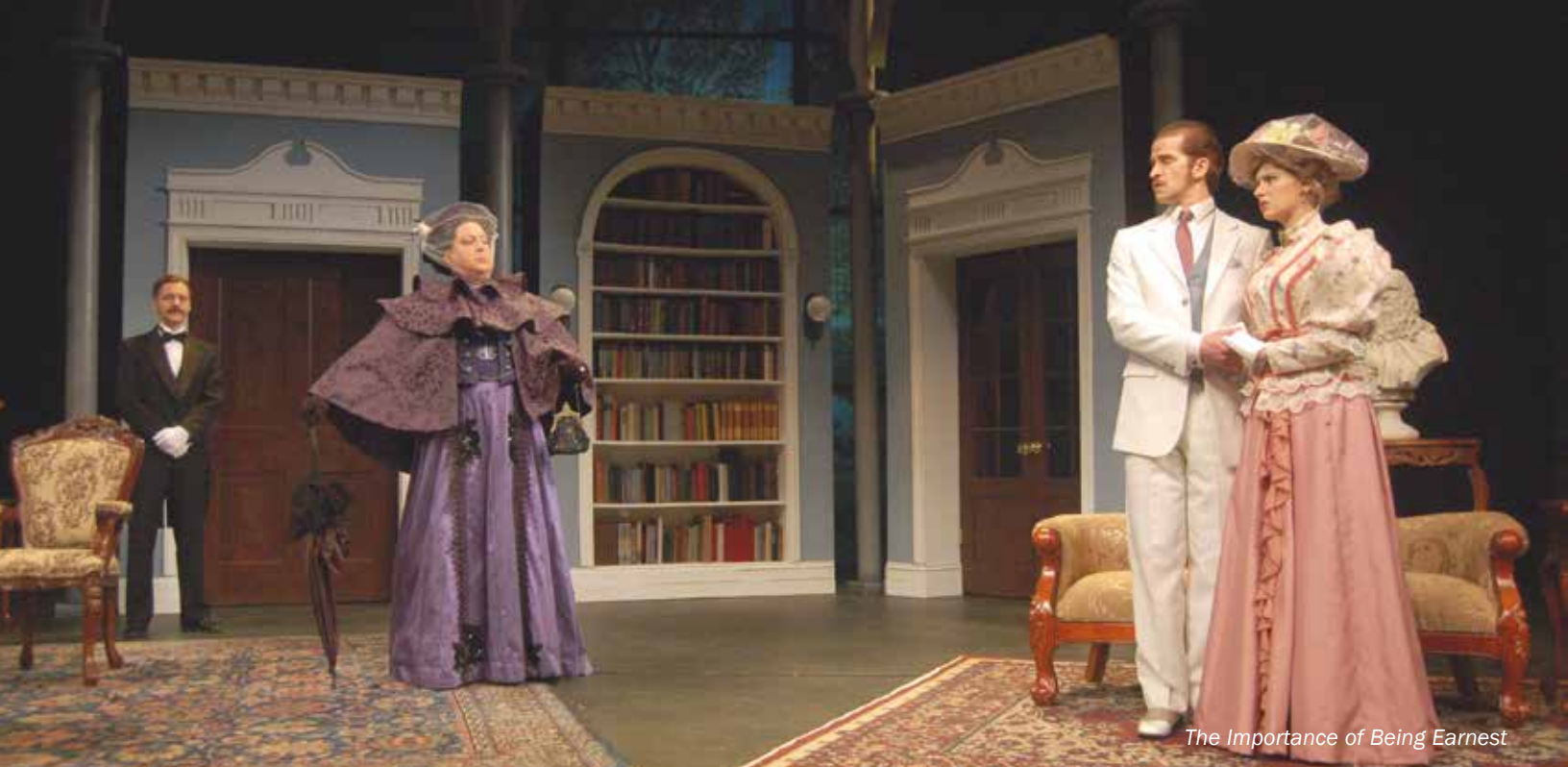
The Importance of Being Earnest

The B.F.A. in Acting from UWSP has helped students like you launch rich and exciting careers in the field. Graduates of this program have studied at nationally ranked graduate programs, worked for touring companies and performed in theatres from Broadway to Chicago to Los Angeles, as well as in commercials, movies and television series.