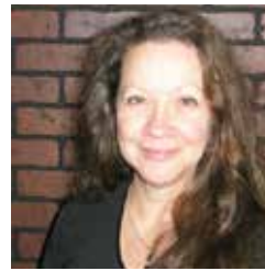
Barbara Cirno costume shop