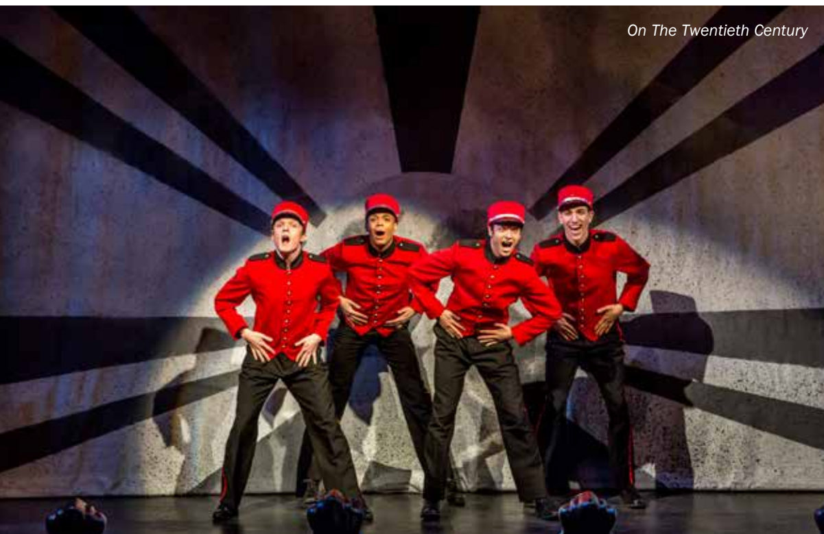
On The Twentieth Century