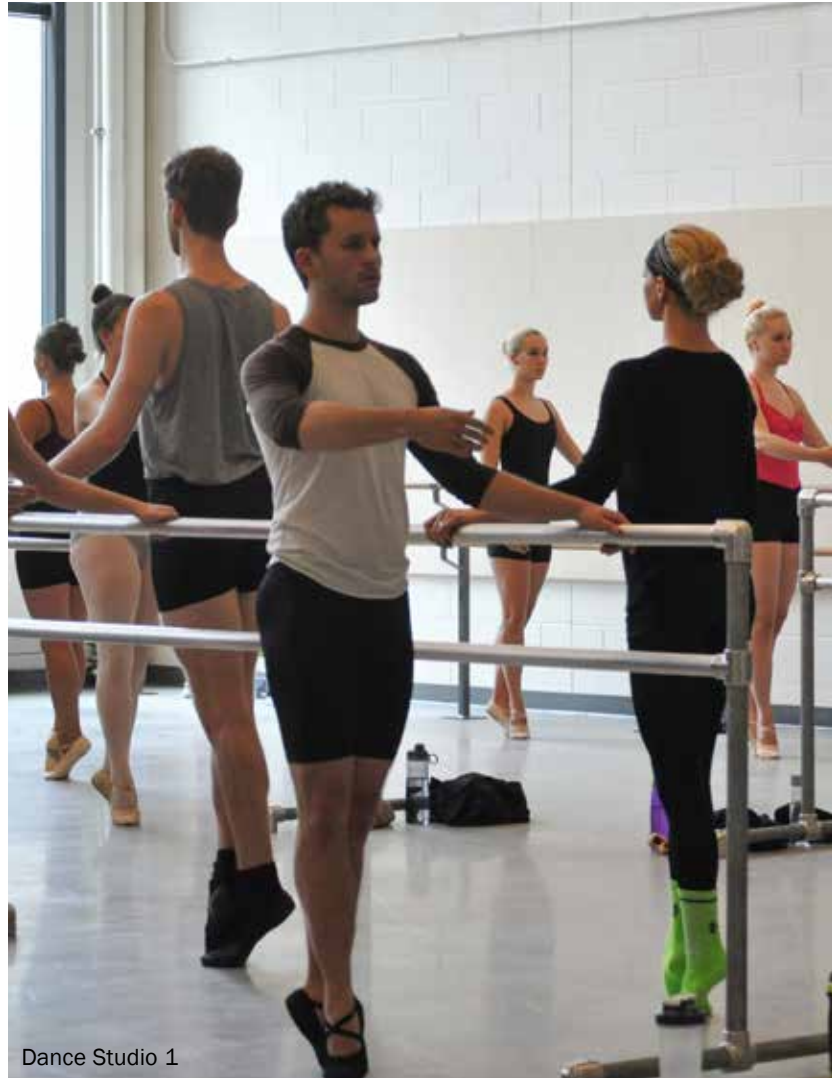
Dance Studio 1