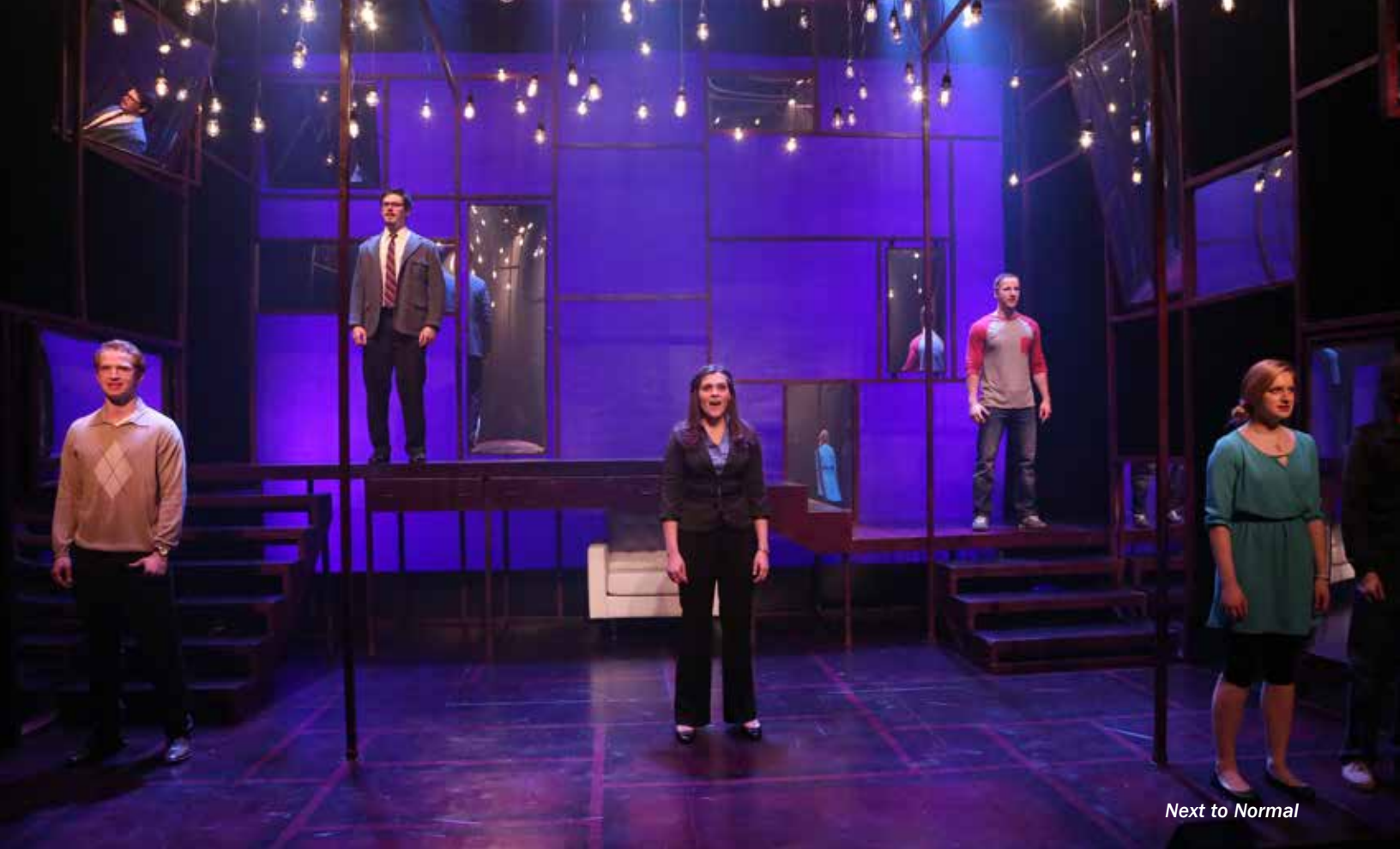
Next to Normal

There are multiple performance opportunities available for you, including fully mounted productions in the Noel Fine Arts Center and a touring Senior Showcase that introduces you to agents, casting directors and other professionals working in the business (see Senior Showcase, page 32).