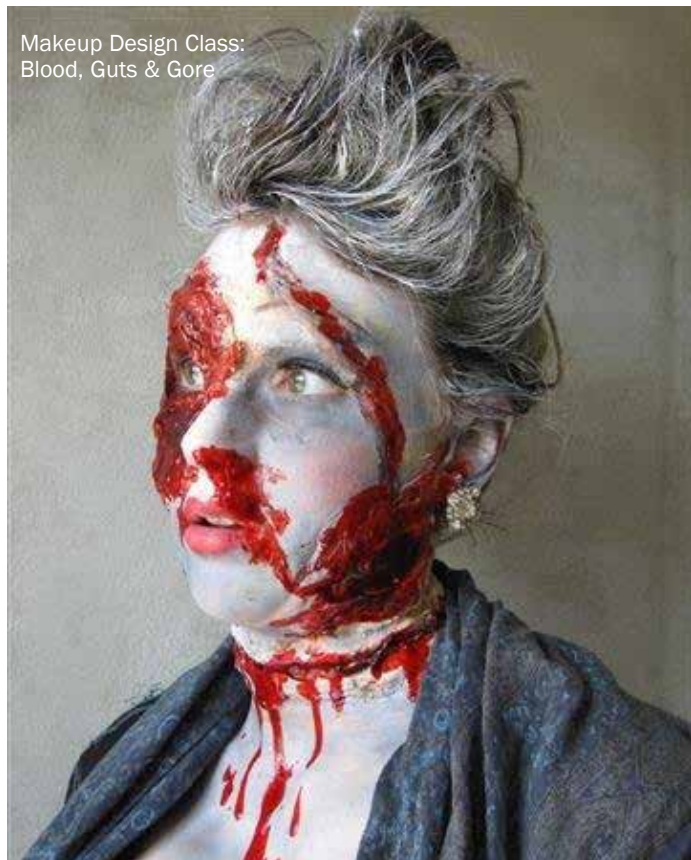
Makeup Design Class: Blood, Guts & Gore