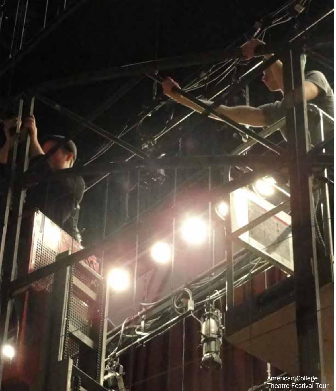
American College Theatre Festival Tour