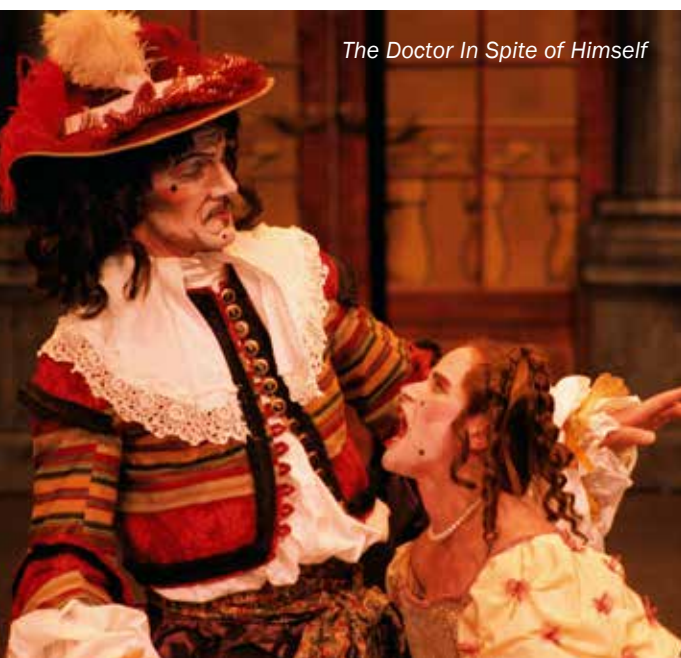
The Doctor In Spite of Himself

Admission to the program is by interview/application only. See pages 34-35 for details.