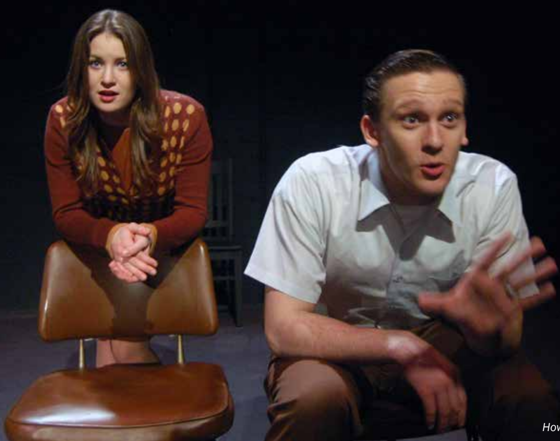
How I Learned to Drive