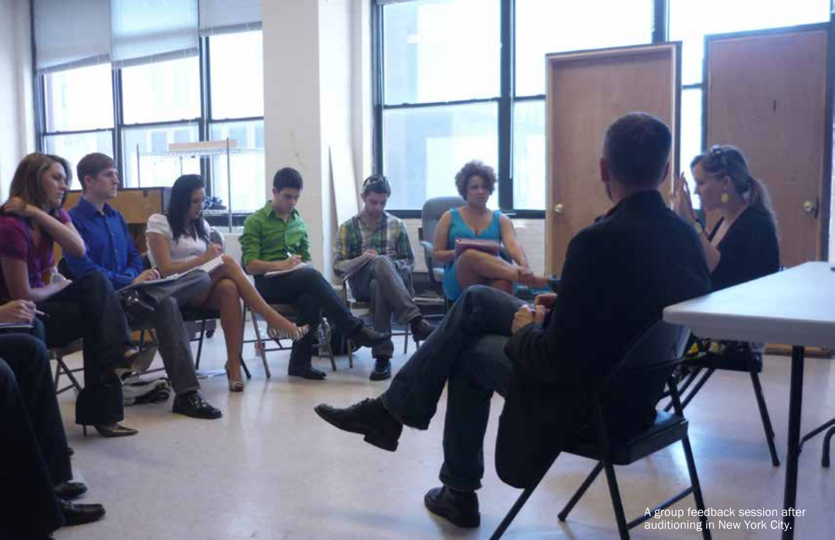
A group feedback session after auditions in New York City.